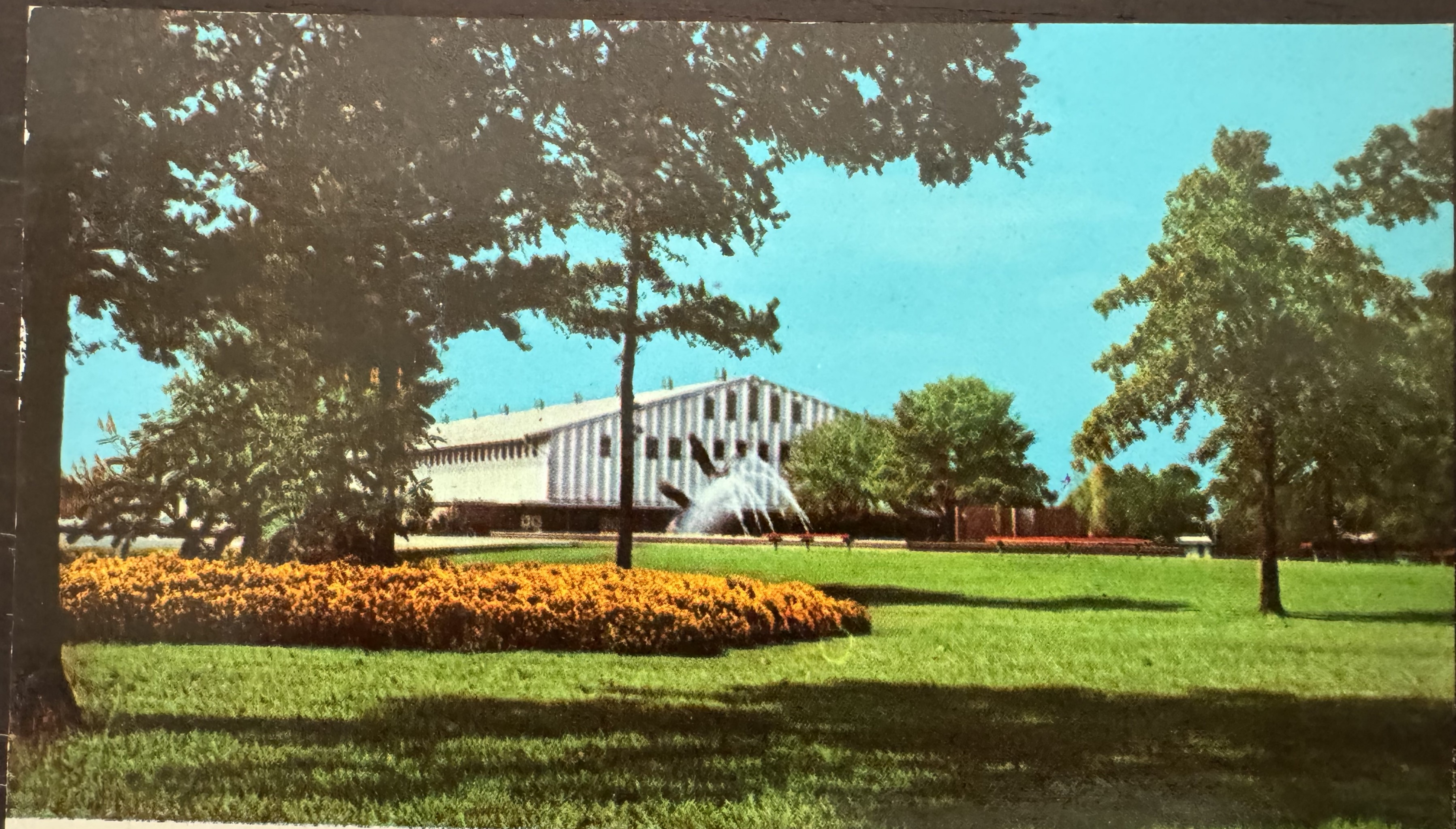
Field House-Dining Hall Complex